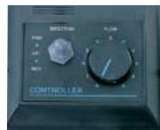
Close-up of the detachable wall-mount controller for variable-speed pumps 77110-60 and -67.