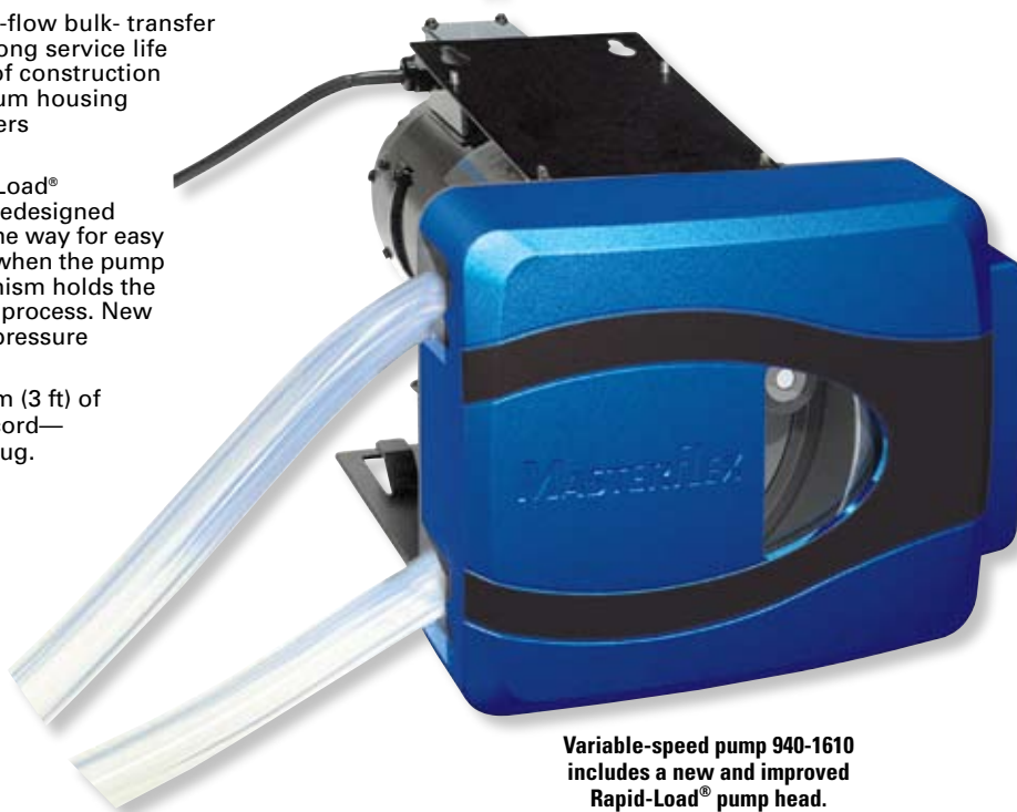
Variable-speed pump 940-1610 includes a new and improved Rapid-Load® pump head.