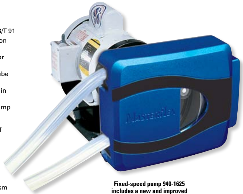
Fixed-speed pump 940-1625 includes a new and improved Rapid-Load® pump head